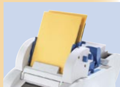
2 sheet feeders and 1 insert/BRE feeder